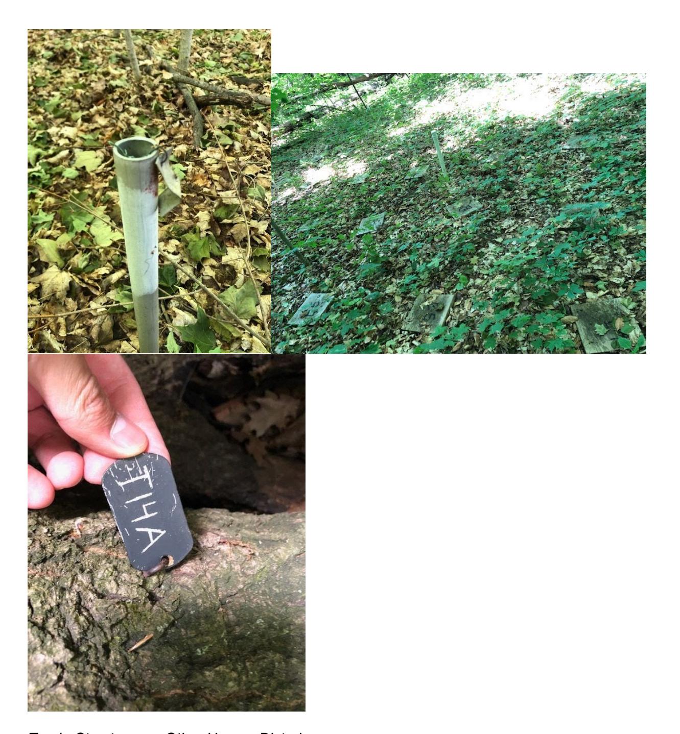
Trash, Structures or Other Human Disturbance

While there were a few glass bottles scattered sparsely throughout Tourney Woodlot, the main concern for trash was a large pile of bags and bottles (Figure 2). We spotted a couple structures in the forest as well: A hunting stand attached to a tree, a small plot of chopped logs, and a deliberately stacked pile of logs. The hunting stand merits further investigation as hunting is prohibited in campus natural areas.